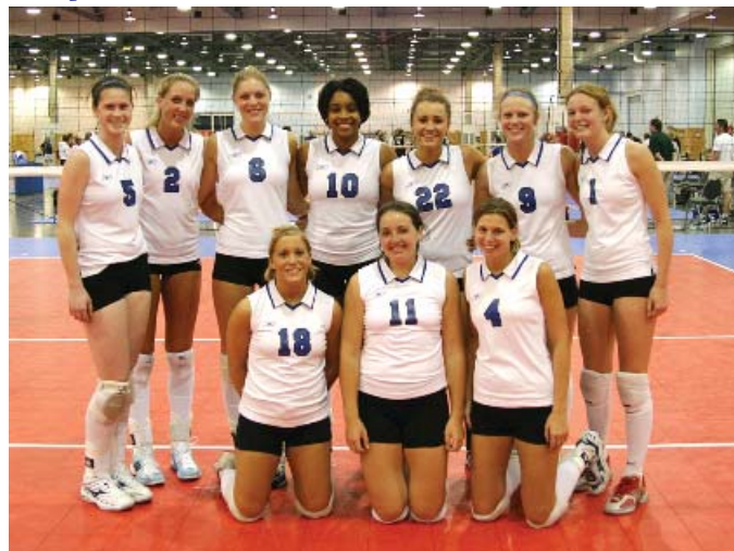
6 th place, 18s: A.C.E. (Akron-Canton Elite) – A.C.E. Lions