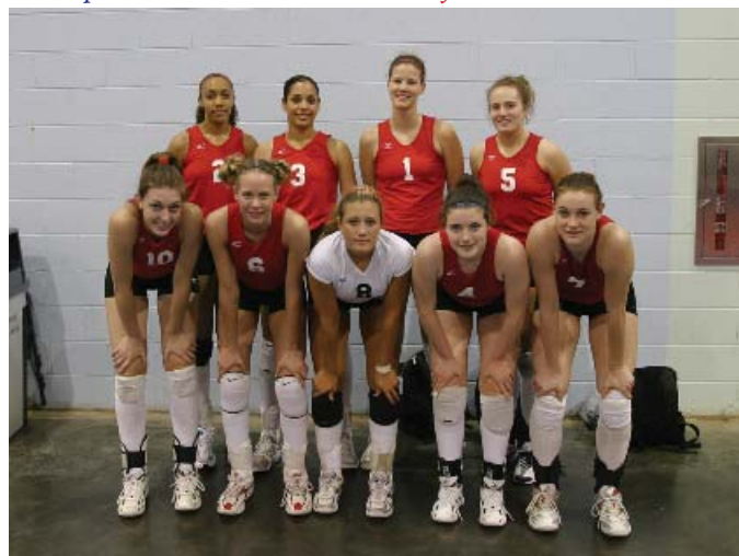
4 th place, 18s: Central Ohio Volleyball Club – 18 Miller