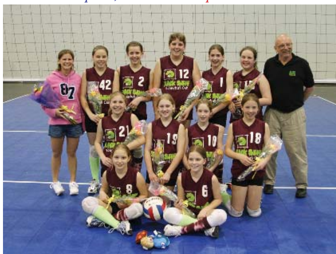
1 st place, 12s: Blackswamp VBC – 12