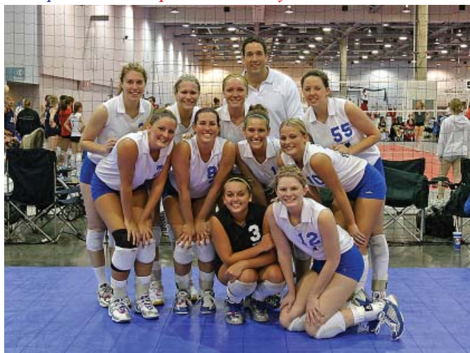
2 nd place, 18s: Kaepa Toledo Volleyball Club – TVC 18-2