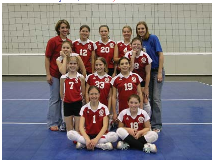
2 nd place, 12s: Cincy VBC – 12 Red