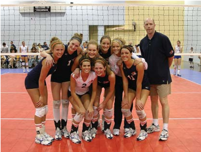
2 nd place, 17s: Team Z – 17-1