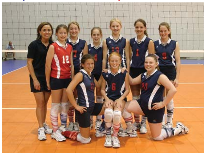
3 rd place, 12s: Northern Kentucky VBC – 12-1 Tsunami