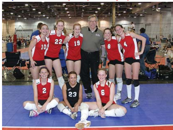
4 th place, 14s: Glass City Volleyball Company – 14 Diamond