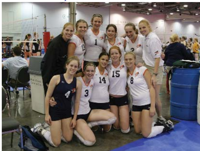
5 th place, 16s: Team Z – 16-2