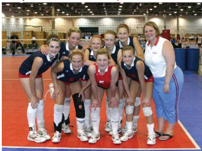
3 rd place, 14s: Northern Kentucky VBC – 14-1 Tsunami