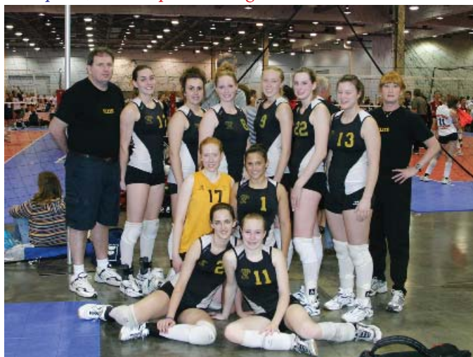
4 th place, 16s: Kaepa Pittsburgh Elite VB Assn – 16 Black