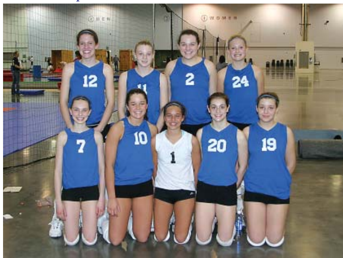
8 th place, 14s: Northshore VBC – 14 Gold