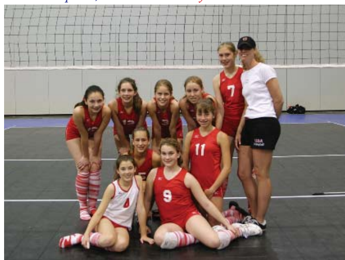
2 nd place, 13s: Mizuno Cincy Classics – 13 Red