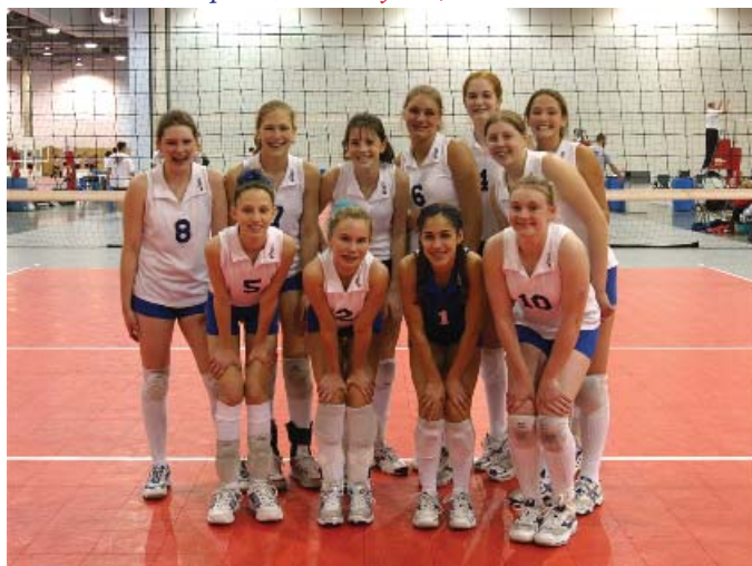
7 th place, 14s: Dayton Jrs. – 14-Ha