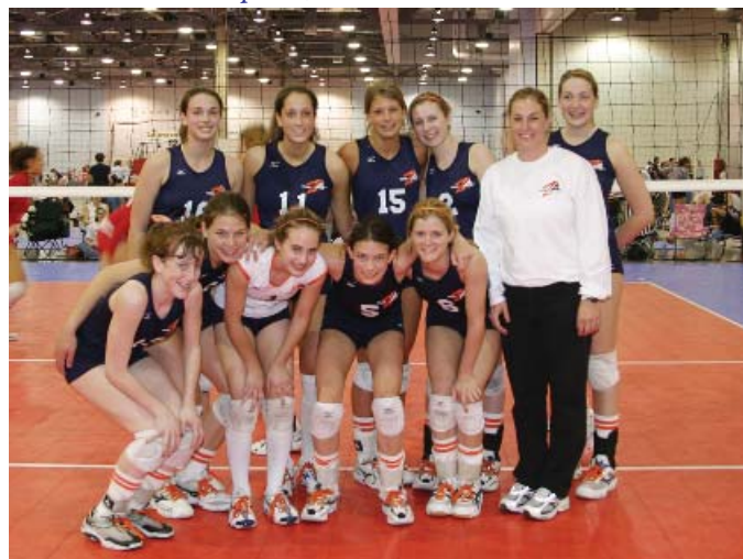
1 st place, 15s: Team Z – 15-1