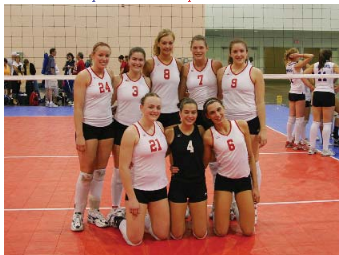
5 th place, 18s: Matchpoint – 18 Red