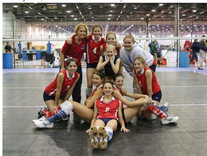
1 st place, 13s: Northern Kentucky VBC – 13-1 Tsunami