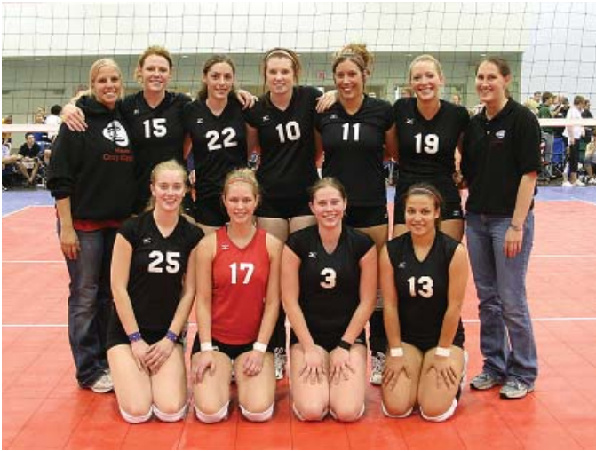
1 st place, 17s: Mizuno Cincy Classics – 17 Red