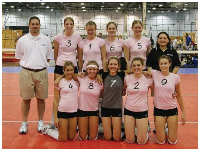
5 th place, 14s: Team Atlantis VBC – 14 Elite