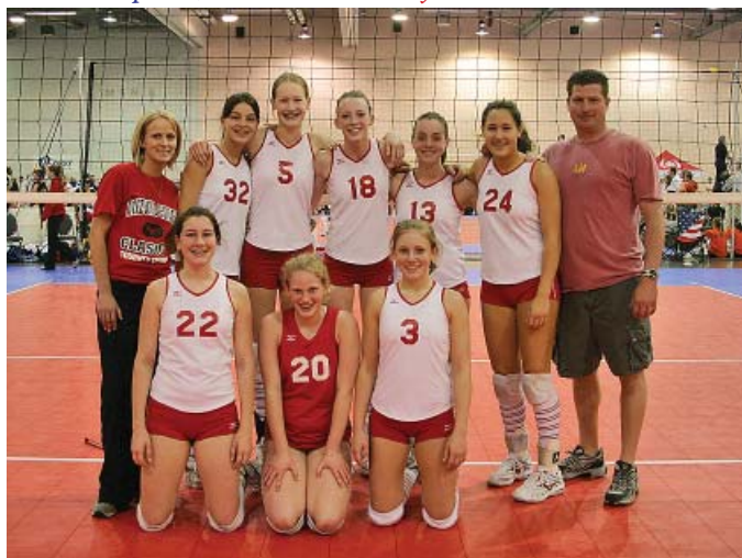
1 st place, 14s: Mizuno Cincy Classics – 14 Red