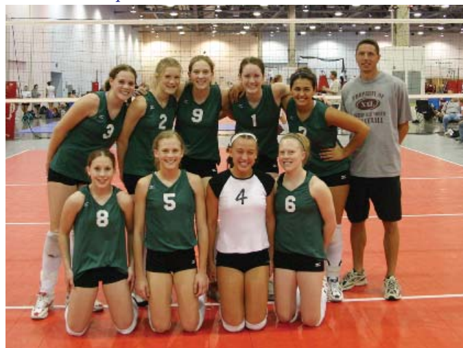
2 nd place, 15s: Team Atlantis – 15 Elite