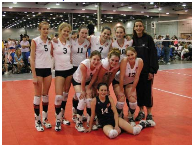
2 nd place, 14s: Team Z – 14-1