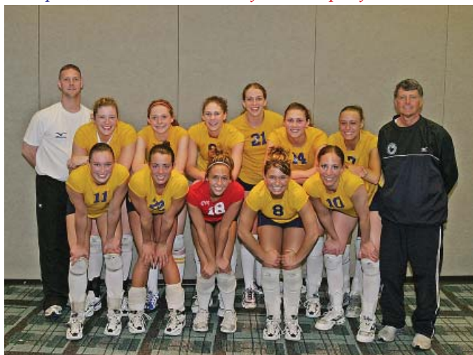
1 st place, 18s: Cleveland Volleyball Company – 18 Black