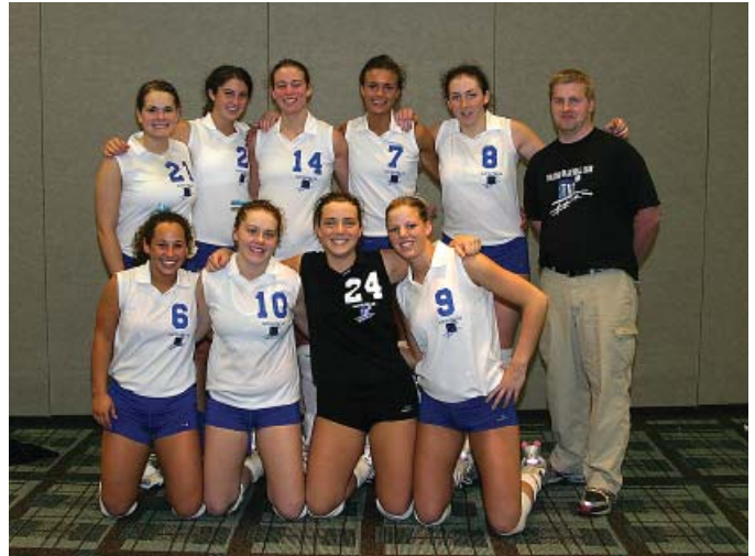
5 th place, 17s: Kaepa Toledo Volleyball Club – TVC 17-1