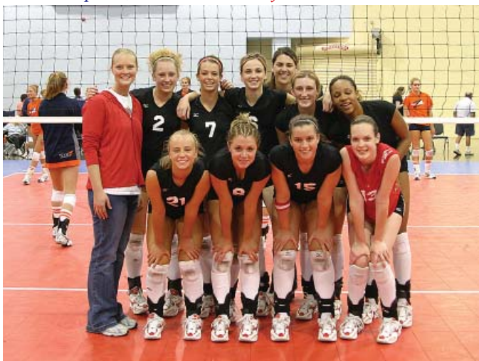
1 st place, 16s: Mizuno Cincy Classics – 16 Red