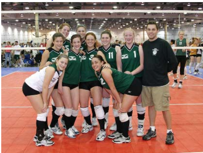
2 nd place, 16s: SW Ohio Thunderbirds