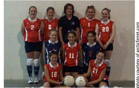
NKYVC 121 Tide – the future looks bright!