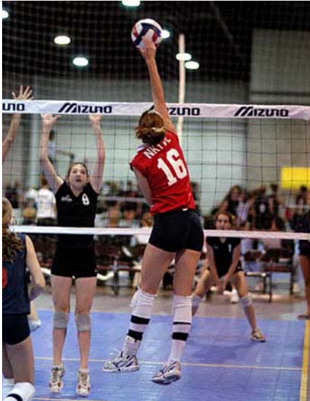
141 Tsunami – Sky's the Limit!

For the 3 rd consecutive year Northern Kentucky-Ohio Volleyball Club has sent teams from every age division to the USA Girl's Junior Olympic Nationals. This year was no exception as the 121, 131, 141 and 151 squads arrived in Atlanta excited to represent the NKYVC family and eager to compete against the nation's best.