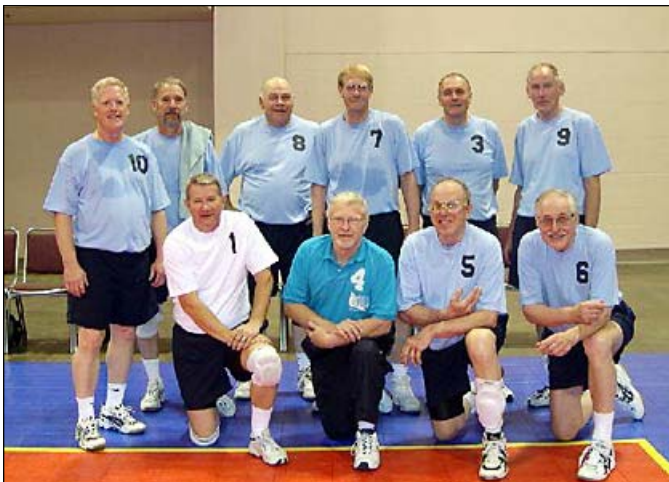
Miami Valley Masters 60s