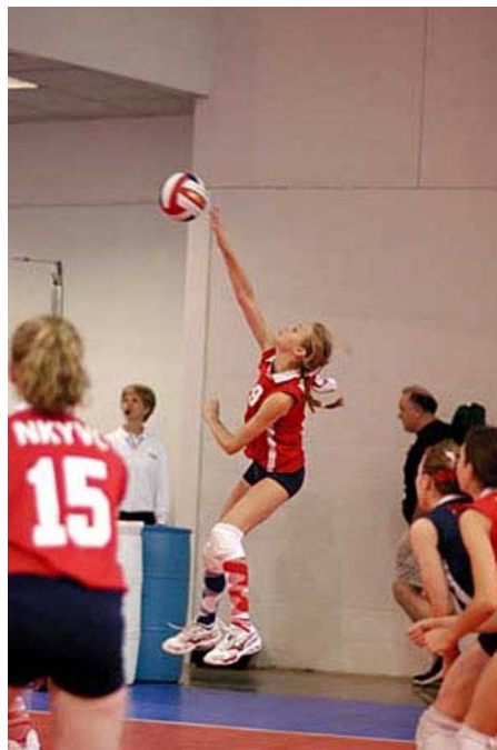
NKYVC 131 Tide Reaching New Heights!

The following coaches and players represented NKYVC and the OVR at the 2003 USA Junior Olympic Nationals held in Atlanta.