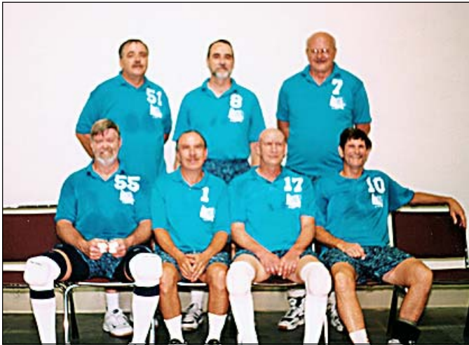
Miami Valley Masters 55s

Nearly 500 teams competed in the 2003 USA Volleyball National Championships, held at the Minneapolis Convention Center on May 24-31, 2003. Competition was divided into two sessions: May 24-27 and May 28-31. The following accounts were contributed by the participants.