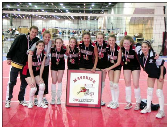
Dayton Juniors Volleyball Club – 14 Rash First Place, 14 Club Copper