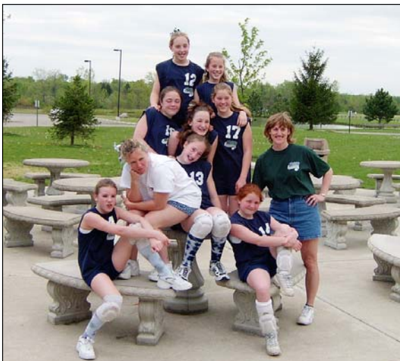
C.O.A.S.T. – 12-1 Third Place, 12s Nickel