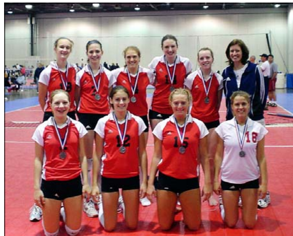
Central Ohio Volleyball Club – 15-1 Second Place, 15 Open Copper