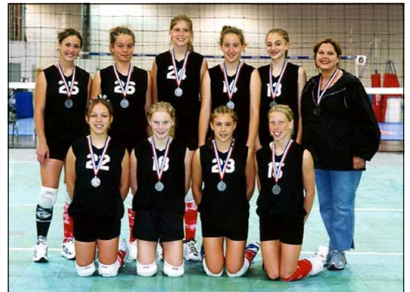
Wooster Volleyball Club – 13 Red Second Place, 13s Aluminum