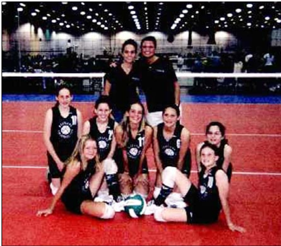
Westland Volleyball Club – C & L's Second Place, 13s Platinum